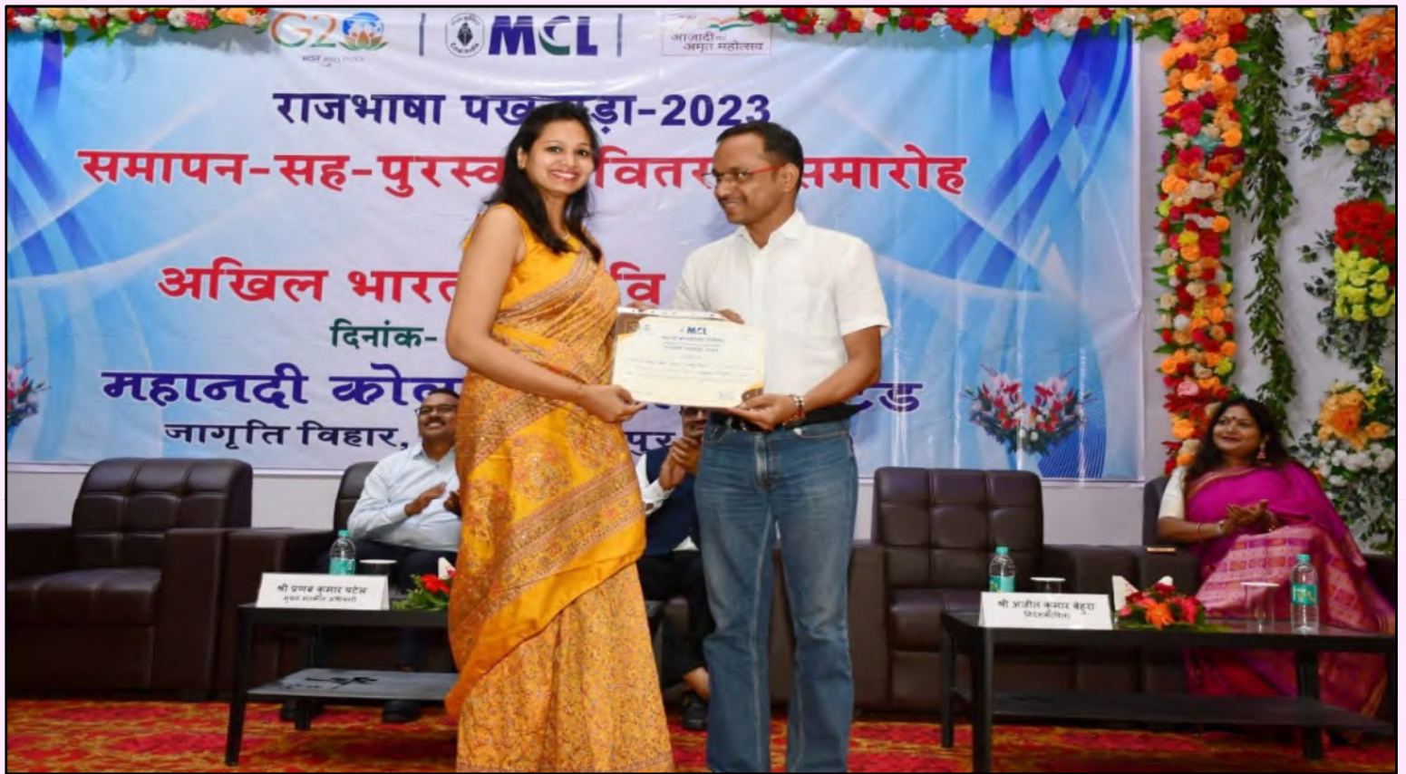
AWARD - WIPS MEMBERS IN DEBATE COMPETITION