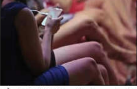
कारोबार चल रहा था। उस घर से कई अपविजयक सामान भी जब्त किया गया है। जानकारी के अनुसार बोड़ानगरी थाना अंतर्गत तअला साही में आजपुर जिला के 40 वर्षीय महिला पर भाड़े पर लेकर पिछले 5 माह से रह रही थी। उसके पास दो कोर्टेज कार भी रहते हुए देह व्यापार का कारोबार कर रही थी। वह दोनों छात्रा डेकनल, नयागढ़ जिला

कटक १४/०१ (संबाददाता) : कटक बोड़ानगरी तअला साही में चलने वाली देह व्यापार केंद्र का कमिश्नरेंट पुलिस ने पर्दाफास किया है। इस जगह पर धाड़ले से जिस्मफरोशी का कारोबार चल रहा था। इसके बारे में खबर पाकर पुलिस छापेमारी करते हुए इस कारोबार को बंद कर दिया। सातों की उम्र की महिलाओं को उद्धार किया है, जिन्हें से दो कोर्टों जगहा शामिल है। इसके अलावा 6 घण्टाओं को पुलिस ने गिर तार किया है। जिस घर में वह