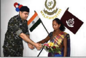
हो जाने पर वह छत्रीसगढ़ के रंदाकाराण्य एपेराज जालक महिठी में पाटी सदस्य के रूप में शामिल तो गई थी और बिधिसा नकसली बादायाओं में शामिल रही। वर्तमान वह जिला के माथिरी थाना इलाके में सक्रिय थी। बताया गया है कि ओडिशा और छत्रीसगढ़ सरकार द्वारा आत्मसमर्पण करने वाले नकसलियों को दयावा की 10 घण्टा में लाने के लिए है।