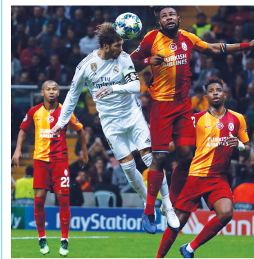
Sergio Ramos battles for ball possession