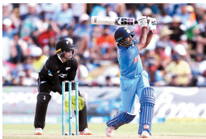
Ambati Rayudu plays a shot during third ODI against New Zealand

MCL e-Procurement Helpdesk (Ph-0663-2542695/2542264), e-mail - hlp-eproc.mcl@coalindia.in R-4901 Give a missed call on toll free number 1800 200 3004 to get our Apps.