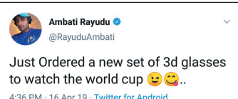
Just Ordered a new set of 3d glasses to watch the world cup 🤓🤓🤓.. 4:36 PM · 16 Apr 19 · Twitter for Android

However, Gambhir, who has been Pant's first first-class captain, felt that this omission can't be termed a setback at all as he had not grabbed the opportunities presented before him.