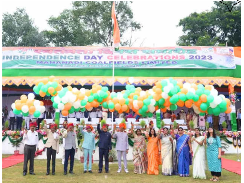
Dignitaries releasing the tricolor balloons on the occasion of Independence Day