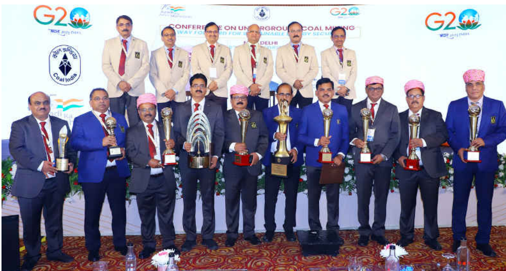
Team MCL at Coal Minister's Award function at New Delhi.