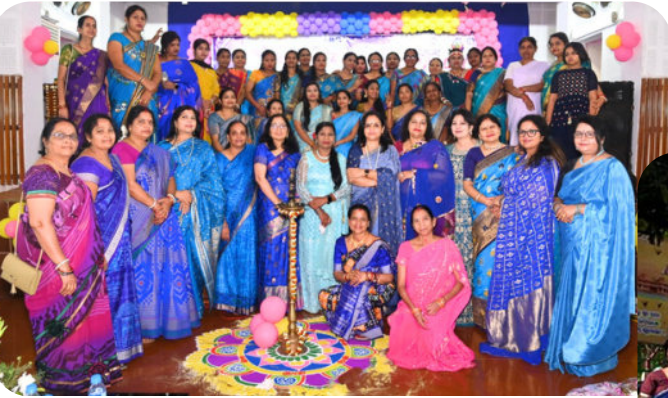
Ib Valley Area