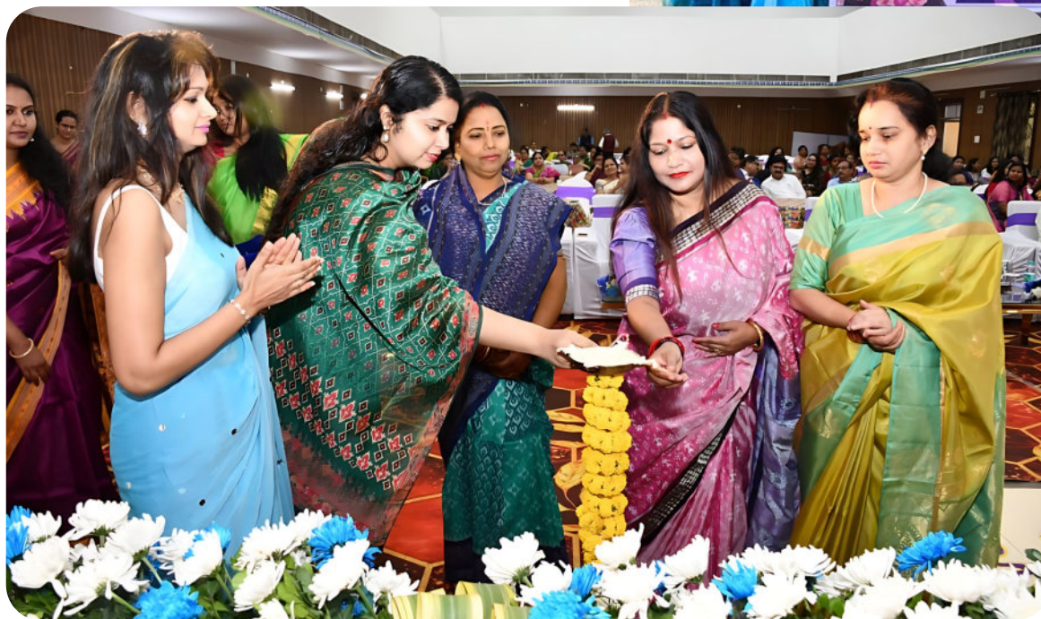
MCL HQ Sambalpur